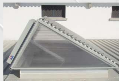
Asymmetrical DELTA LIGHT