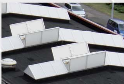
... with integrated NSHEVs Typ PHOENIX