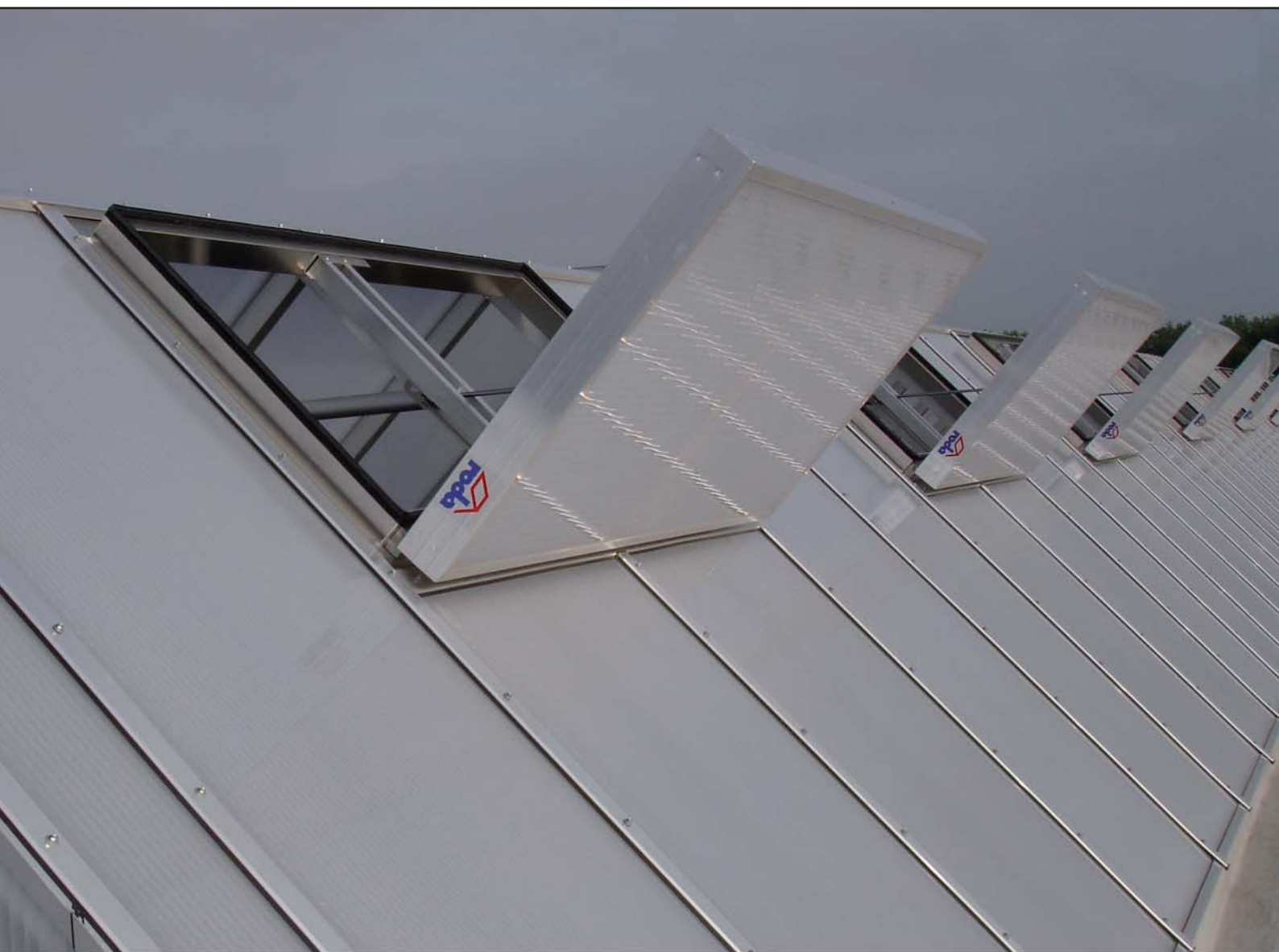
Large illustration: DELTALIGHT with NSHE units type PHOENIX NSE wings.