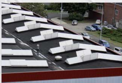
DELTA LIGHT on a productionhall ...