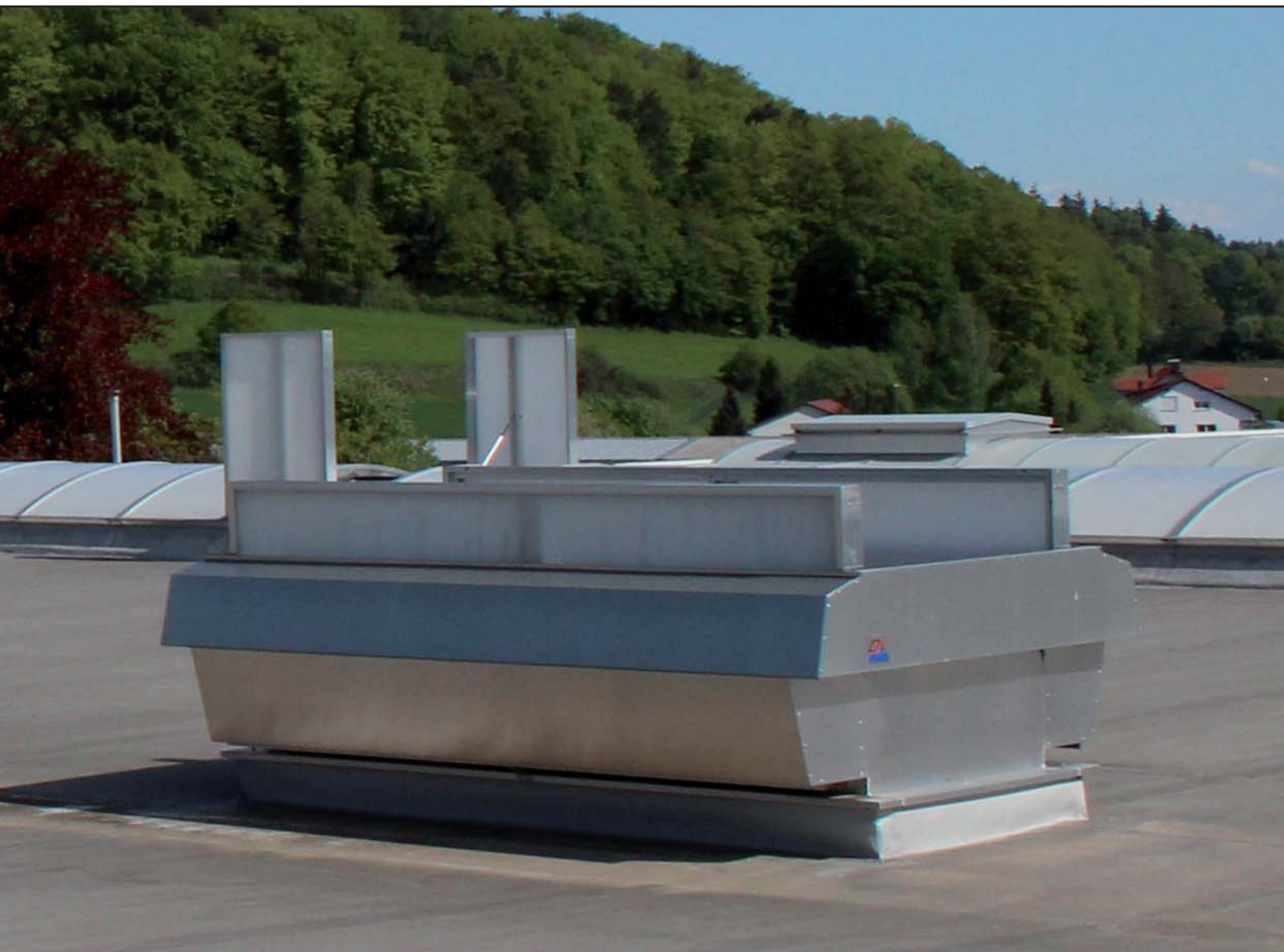
Large illustration: MEGAPHOENIX as a stand-alone unit on a factory building.