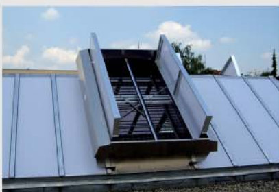
MEGAPHOENIX in a sloped roof