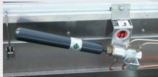
thermal priority valve connected to a CO 2 cartridge