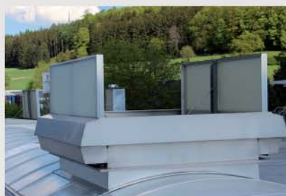
MEGAPHOENIX on a skylight