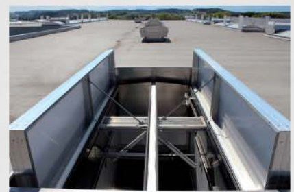
The inside of a MEGAPHOENIX