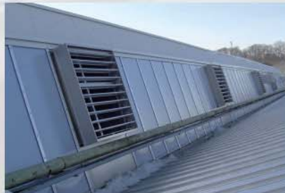
... and after the redevelopment