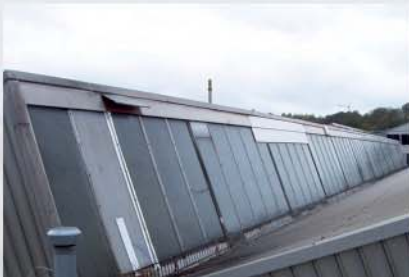
Northlight glazing before ...

Large illustration: Lumira™-filled multiwall panels replace the wired glass after renovation.