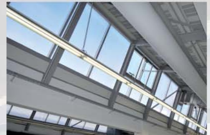
Northlight glazing for a textile factory